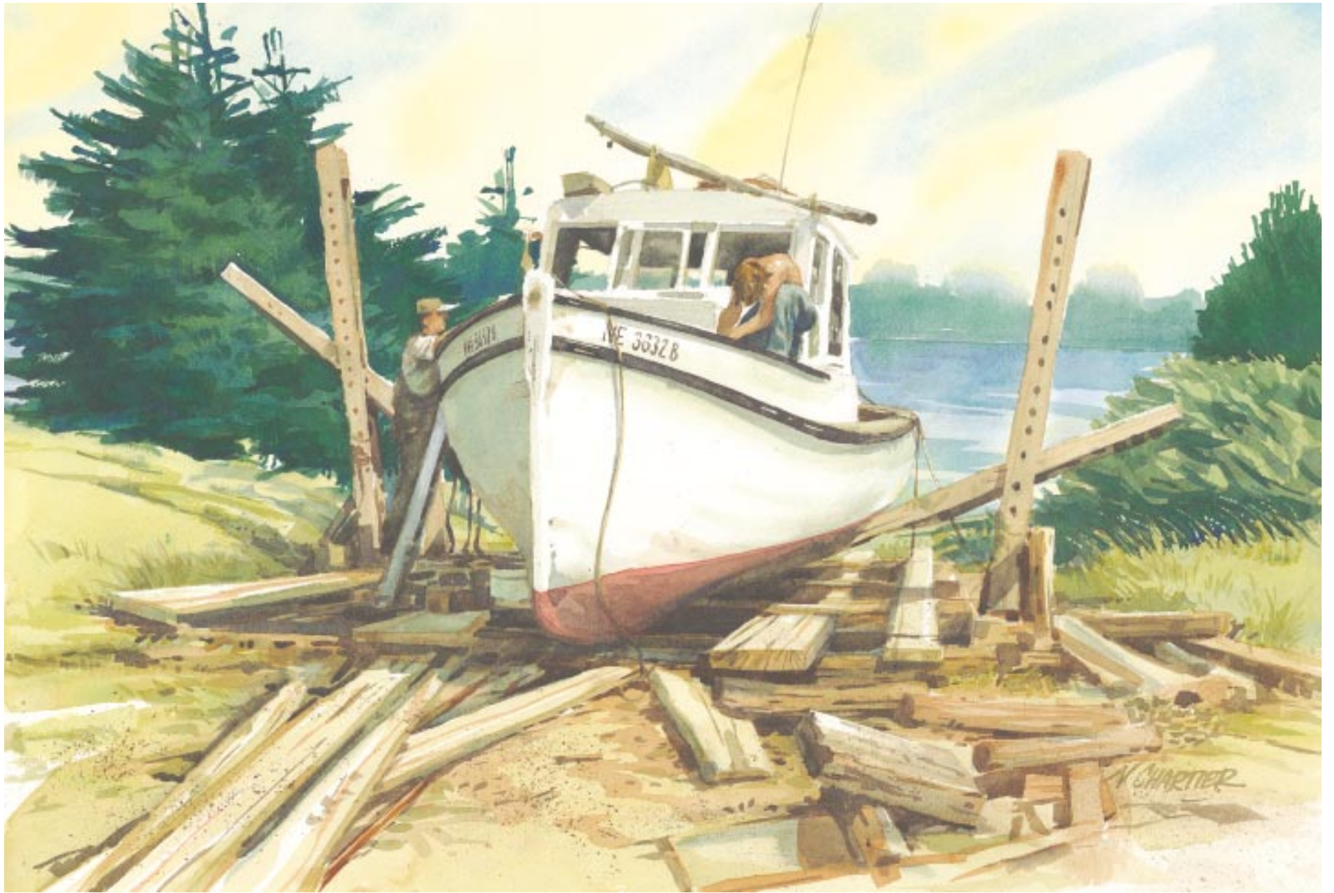
"Alvin's Classic" 20 x 14"