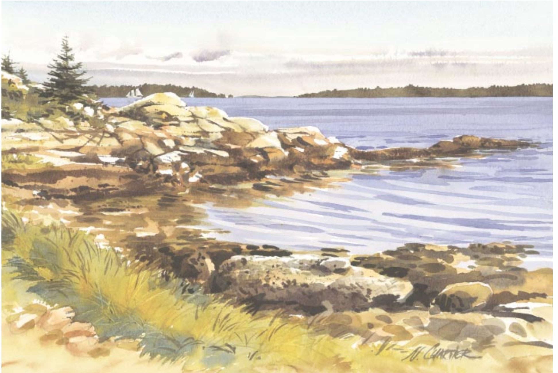
"Sunday Saints" 16 x12"