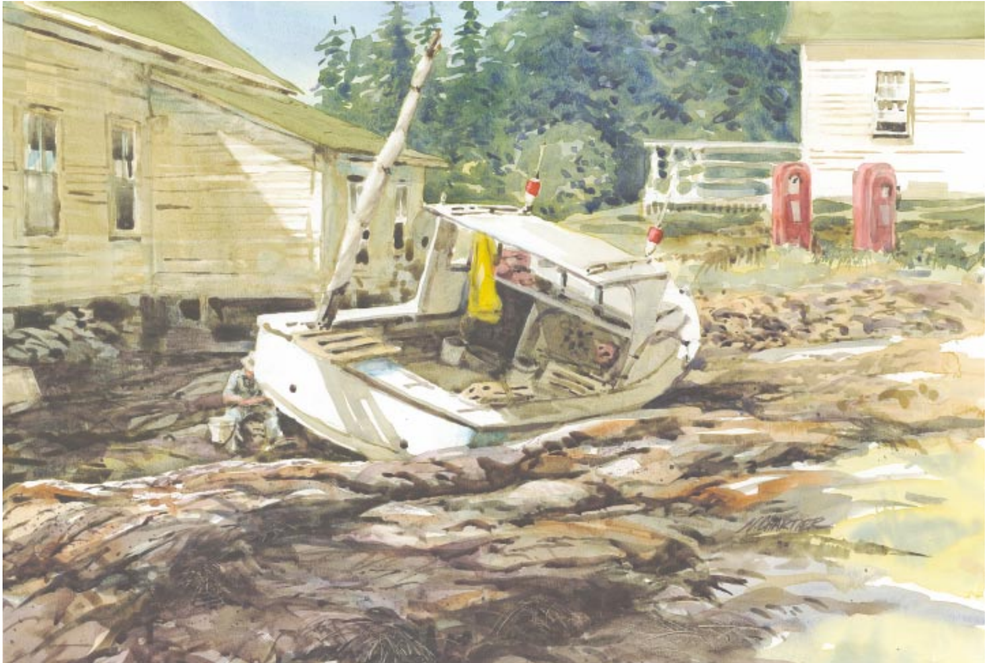
Left, "Hauling on the Sheepscot" 20 x 14" Above, "Tidal Lift" 23.5 x 17"