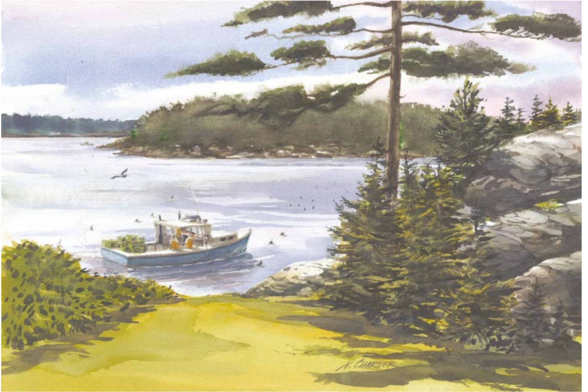
Left , "Six Roofs" 20 x 14" Above , "Early Rising" 20 x 14"