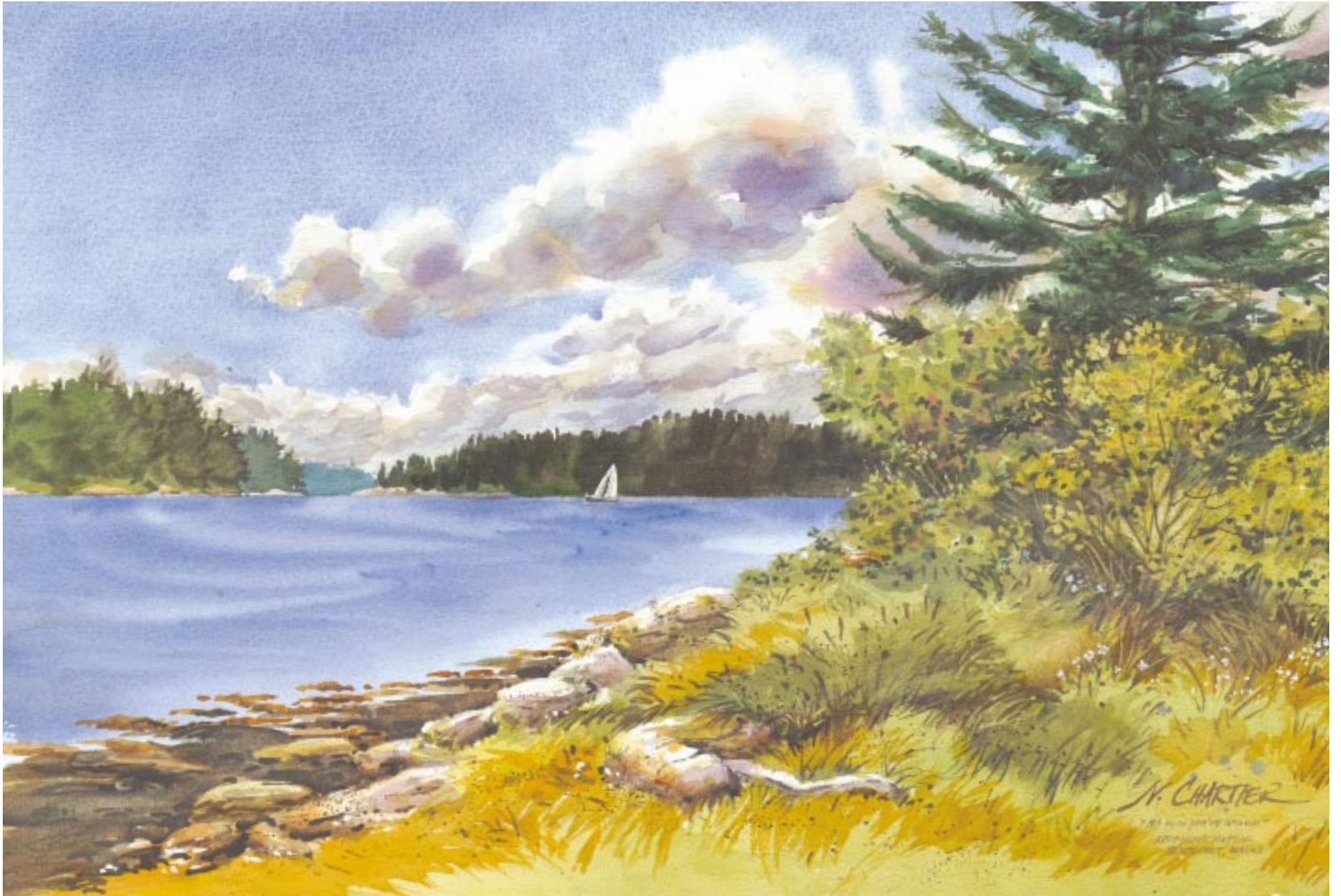
"My How You've Grown" 20 x 14"