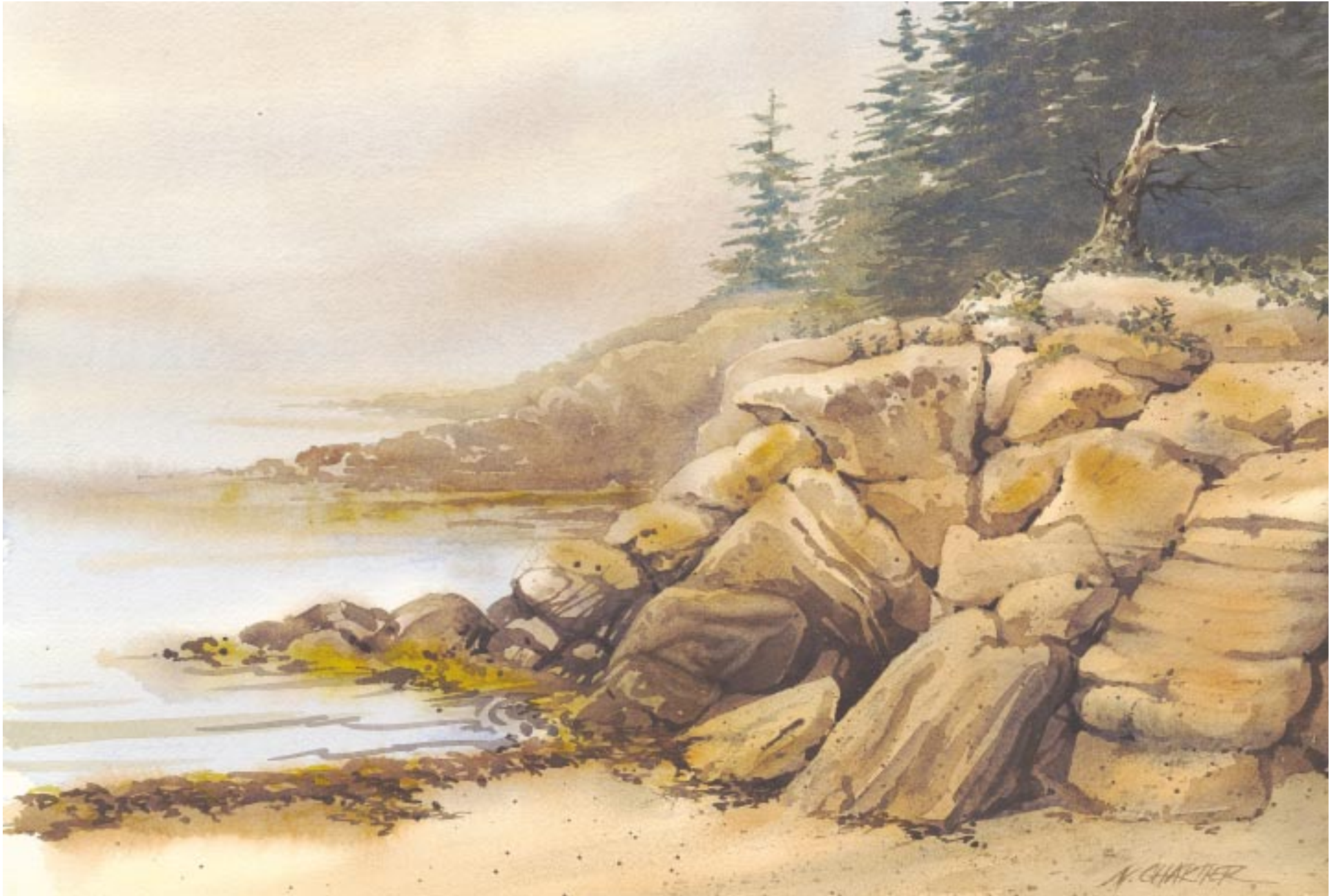
"Territorial Dispute" 20 x 14"